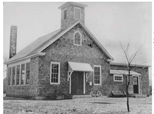
Forked River School in Lacey.

The Forked River School was built in 1868 as a one-room schoolhouse.