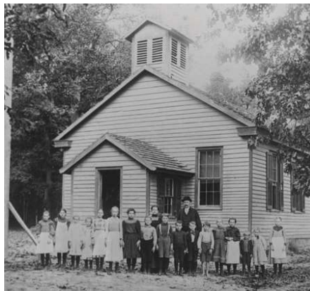
Prospertown Schoolhouse in Jackson.

Trouble during the late 1800s. The school operated from 1893 to 1915 to serve the children of both the lumbering and cranberry workers. Today, the building still stands as part of Double Trouble State Park’s Historic Village and is the oldest remaining structure. The park is open 8:00 AM to dusk. Visitors cannot enter the school building, which is the small building near the parking lot.