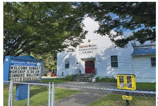
Fulton Street School in Lakewood is now the Greater Bethel Church of God in Christ.