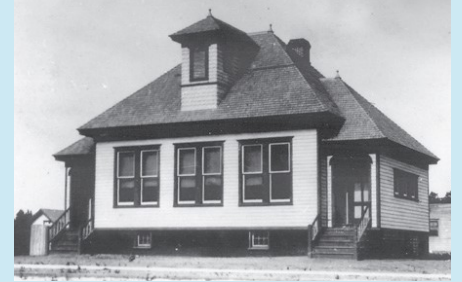
Barnegat Light School House.

One of the holdings of the Barnegat Light Museum, formerly the Barnegat Light School House, is the book of "School Records." Dating back to the early 1900s, the book contains transcribed, typewritten copies of the original pages that were written by the students in pen and are kept safe in the museum's archives. The instructions to students were as follows: