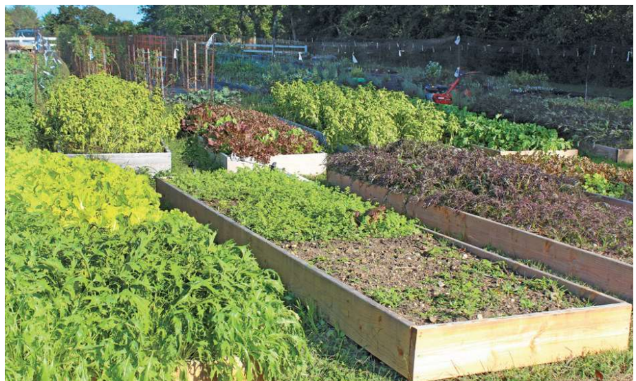
The gardens and greenhouses on the property support local families with medical or financial needs.