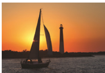
Tom Lynch / www.AngryFishGallery.com

A guide to restaurants, food, and nightlife. Guide: 59 – 66