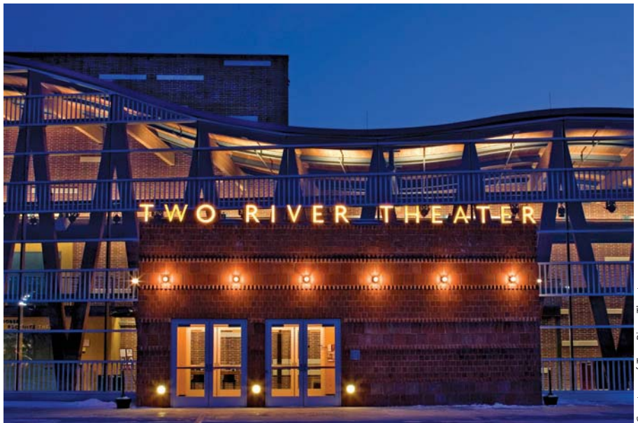
Two River Theater in Red Bank.

The Ocean Grove Camp Meeting owns and maintains the 5,500 seat Great Auditorium that is more than 100 years old. The Great Auditorium hosts some of the great preachers in the world on Sunday mornings and wonderful family enter-